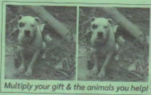
Multiply your gift & the animals you help!

PETA Matching Gifts 501 Front St. Norfolk, VA 23510