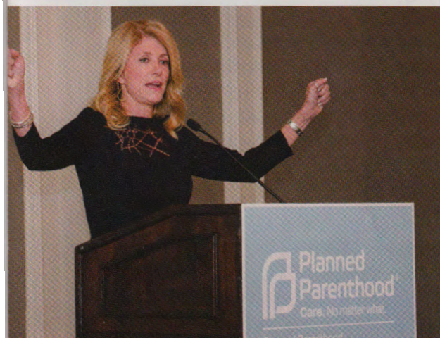
Davis delivers an inspiring message