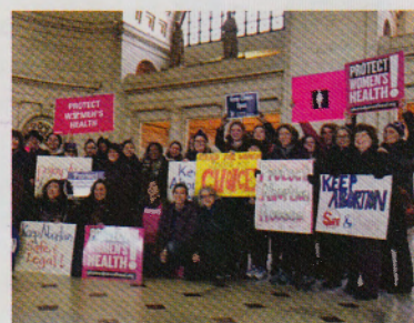
PPSP volunteers joined over 3,000 activists in Washington, DC on March 2 to rally during oral arguments in Whole Woman's Health v. Hellerstedt .

But, their attacks have also served to galvanize our supporters and brought thousands of new ones into our fold. Three thousand of us gathered to rally in front of the Supreme Court steps during the arguments for this case. Planned Parenthood remains the most trusted women's health care provider and an enormously powerful political messenger. Thank you for continuing to support our work. You help us do so much good for so many!