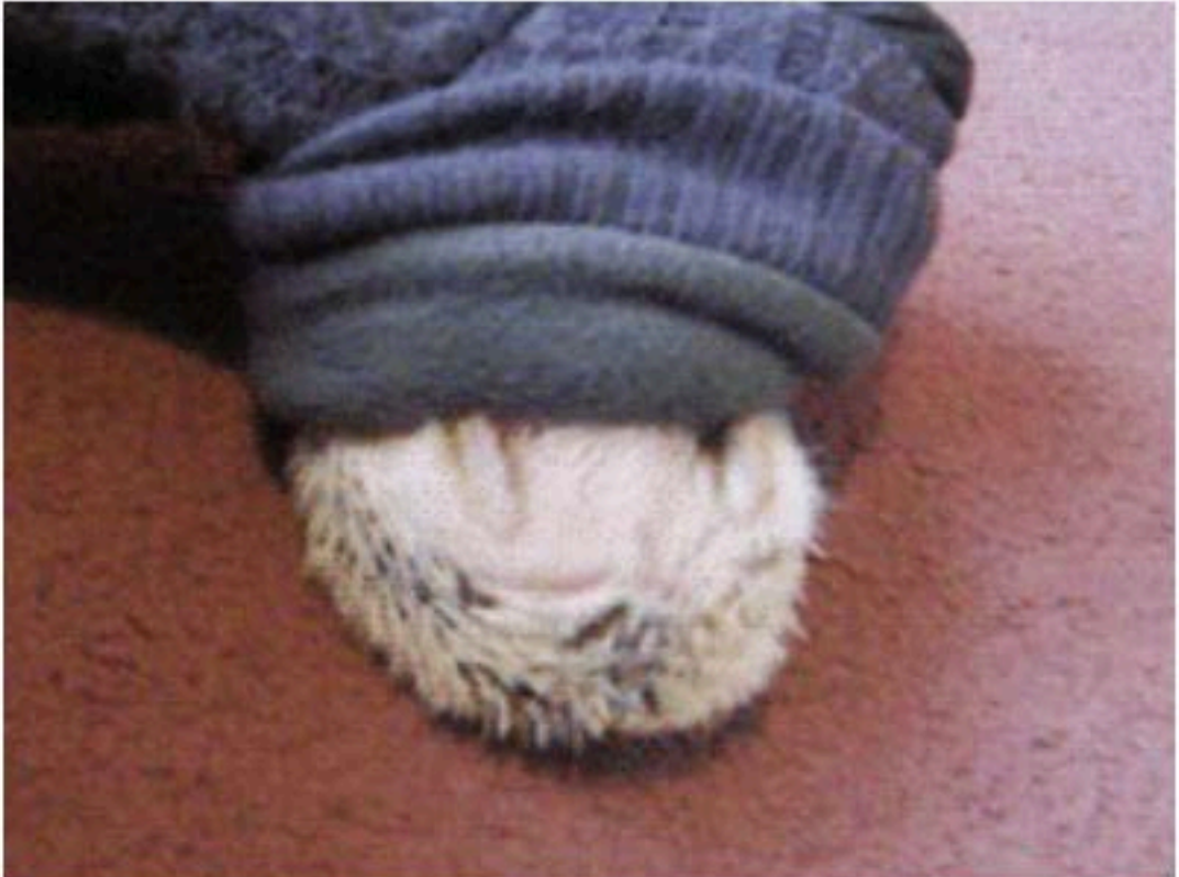
This hamster with stuffed cheeks: