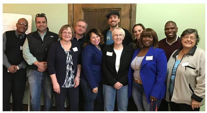
HOW staff and our property management partners at an appreciation lunch at the HOW offices in March.

Donors like you allow us to place homeless individuals and families in supportive housing and support them as they rebuild their lives. Chicago landlords are essential partners as well, making apartments available and offering HOW clients a new start and a new home. Thank you, landlords!