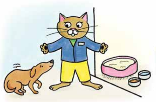
Animal Services Centre Dedicated space to accept lost or surrendered animals and provide them with comfort and care