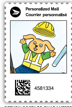
RETURN POSTAGE GUARANTEED PORT DE RETOUR GARANTI