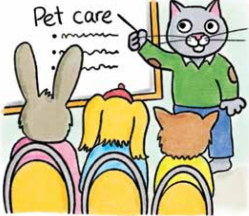
Centre for Humane Education & Wellness - Three dedicated classrooms for educational programming also available for after-hours public use