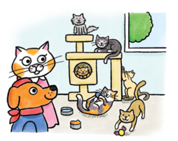
Animal Habitats - Cages replaced with clean, warm, home-like habitats for dogs and cats

The new space will be open, inviting and safe for all of our animal friends. Hurt and vulnerable animals will receive the best possible medical care in surroundings that feel (almost) like home. Also! There will be room for our human friends to learn about pets and what they will need from us when they find their forever home.