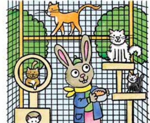
Cat Atrium - Three season Catio to provide adoptable cats with safe outdoor time for enrichment