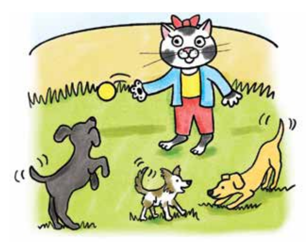
Green Spaces - Fenced and landscaped large and pint-sized dog parks